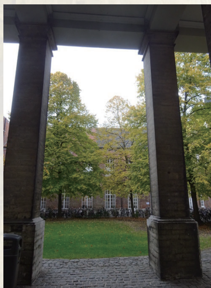
Figure left and right : The venue, Katholieke Universiteit Leuven