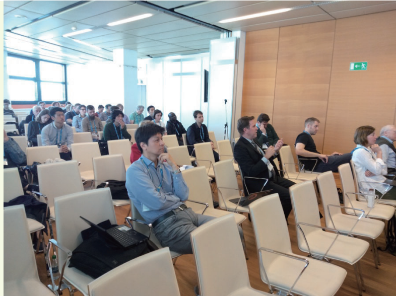
Figures: "Predictions of Solar Flares and Eruptions: Observation, Theory and Modeling" session with 60 audiences