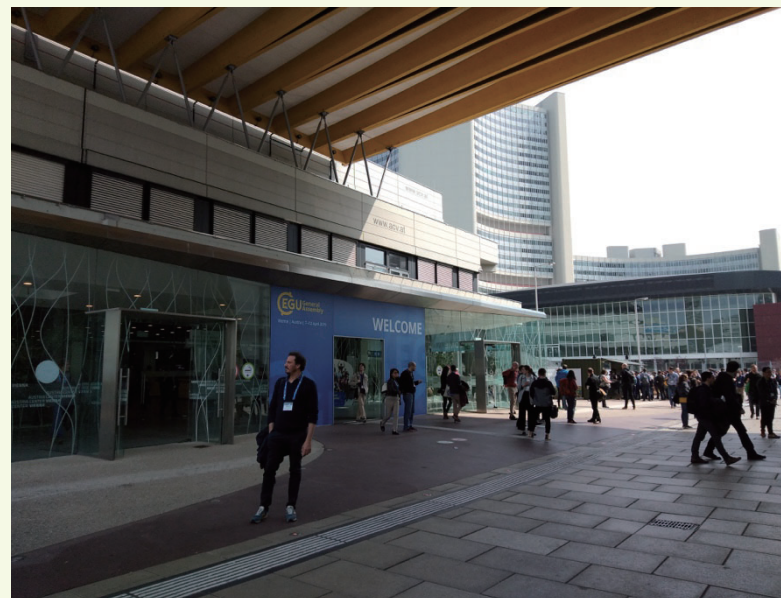
Figure left and right: The venue, Austria Center, Vienna, Austria