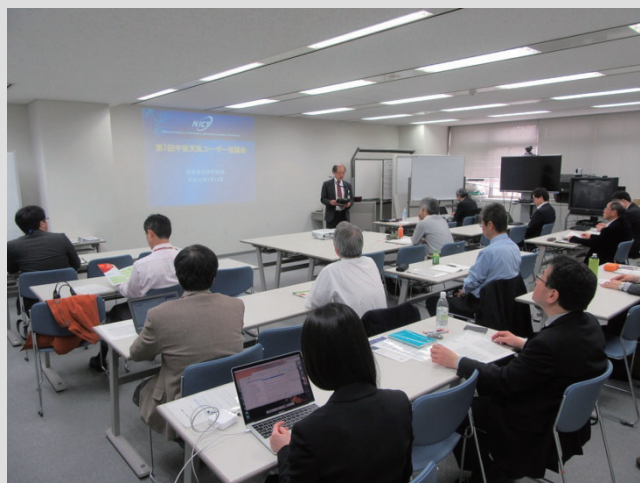
Figure right: the 7 th Space Weather Users Council