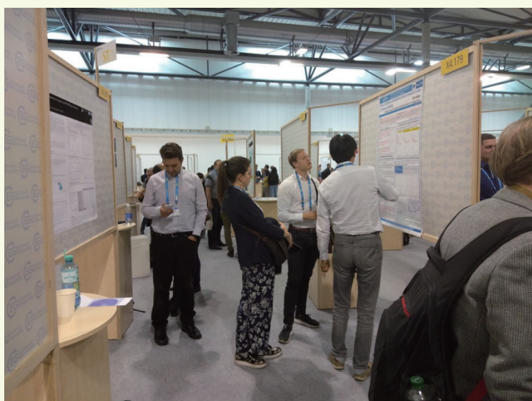
Figure left: The poster session